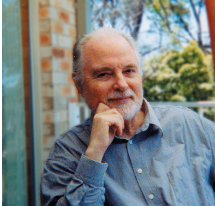
Charles Berner, originator of the Enlightenment Intensive