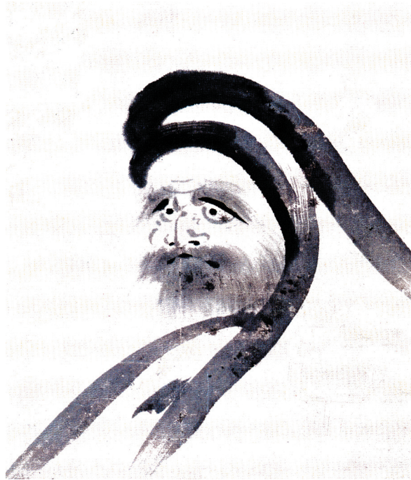
Who am I?

Koans, or key questions, came into being in Rinzai Zen when one master thought it would be useful to limit and specify which aspect of Truth one was intending to consciously, directly know. In India, both in ancient times and modern times, seekers of Truth have pondered the question, 'Who am I?' which also focuses the attention. There are different schools of thought as to whether or not one's attention should be focused and it depends partly on one's purpose. Our purpose is to give the participants on an Enlightenment Intensive an opportunity for an enlightenment experience in three days, so we provide a question which they can use to come into contact with the specific object of their enlightenment. This speeds up the process. However, the question is only a tool. It is not the object of enlightenment. It is a device to help bring the participant closer to his object of enlightenment by aiming him toward it. As a master it is important that you not lead the participants into thinking they are working on answering a question because they are not. They are working on having conscious, direct knowledge of the object of their enlightenment and the question is a tool to help them accomplish this.